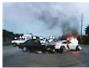
Police Officer Pulls Man From Burning Wreck