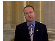
Rep. Jared Polis explains benefits of regulating marijuana