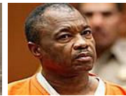
Police Seek 'Grim Sleeper' Link to More Victims