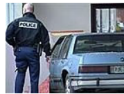
Driver Slams Into Bank When Brakes Fail