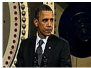
Obama: All Ideas Welcome on Energy Policy