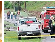
2 Bodies Found After Tenn. Sewage Plant Collapse