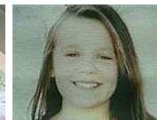
Teen Missing, Never Shows Up at Friend's House

Comments (0) Login or register to post a comment: