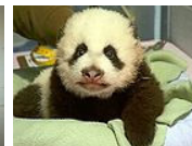
'GMA's' Up-Close Look at Atlanta's Baby Panda