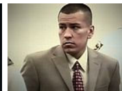
Accused Rapist Cross-Examines Alleged Victim