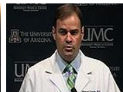
Doctors: Giffords Making "Significant Strides"