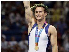
Olympic Champion Hamm Accused of Assault