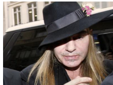
Galliano Guilty in French Anti-Semitism Case