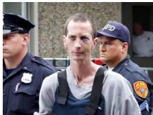
NY Couple Pleads Guilty in 4 Pharmacy Killings