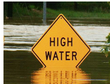
First Person: Water Rises, People Shake Heads